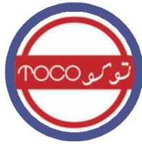
The Oman Construction (TOCO)