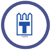
Towel Maintenance LLC