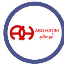
Abo Hatim LLC