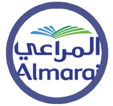
Al Marai Company Limited